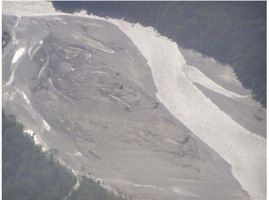
Ok Tedi River.

The damages caused by the mine's waste disposal have had, and will continue to have, long-running implications for the 50,000-plus people who live in the impacted regions, many of them adjacent to or near the river. Sago is the staple food of most communities. The destruction of large areas of sago production due to flooding, especially in areas close to villages along the river and tributaries, will require many people to travel progressively longer distances to obtain smaller quantities of sago. Other changes in the food web are underway as well. These include a severe reduction of fish stocks, the diminishing of traditional fresh water supplies, probable increases in mosquito populations and malaria, and the forced dislocation of farms and gardens.