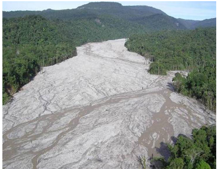
Ok Tedi River.