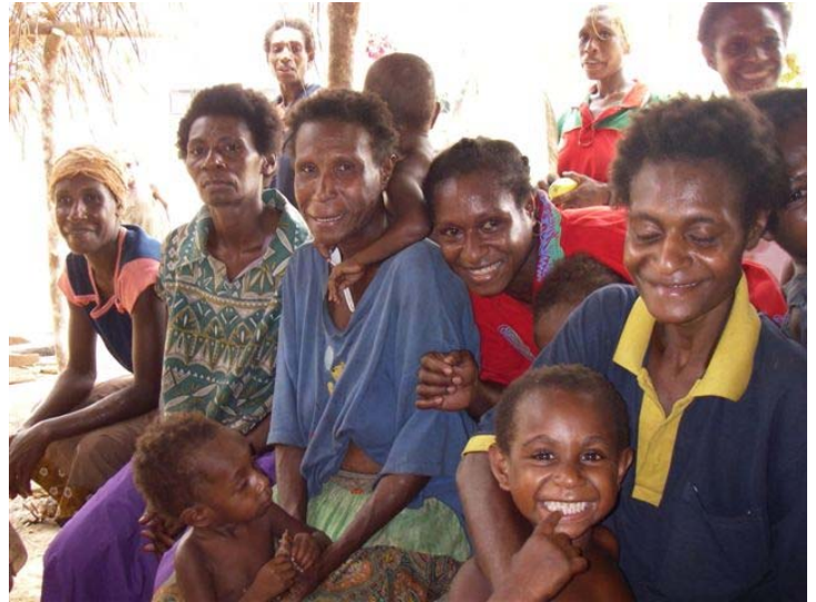
Women and children.

Every village had the opportunity to have a number of facilitated meetings to understand how the process was progressing. Most chose to take advantage of this offer. A few declined for reasons not always pertinent to the negotiations. Some villages that had serious internal divisions (between lawsuit supporters and non-supporters, land owners and land users, clans and tribes at odds with each other) chose not to have meetings. Whenever possible, facilitators tried to meet separately with village women to encourage their special engagement and participation. In total, over 500 meetings took place throughout the CMCA Review.