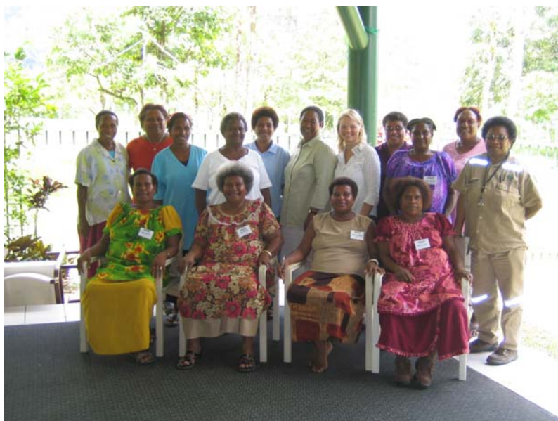
Women's meeting.

As always, numbers by themselves do not tell the full story. In fact, they often obscure many important and salient specifics. The negotiations sought to confront many important cross-currents and tensions. While all of the delegates collectively sought to “expand the pie” in their negotiations with OTML shareholders, the community delegates also had the task of “dividing the pie” between and among the nine river regions. Land owner and land user interests were at odds, as were the interests of those who had or had not supported earlier lawsuits. Many of the mechanical and administrative questions of how new financial arrangements would work were also in question as the process unfolded.