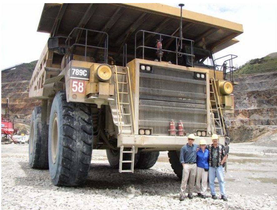
Facilitators and mining equipment.

After 18 months of effort, a major benchmark was accomplished. Delegates of the nine affected regions along the river, the mining company, the government, and others concluded a Memorandum of Agreement (MOA) that will ultimately give the people in the impacted area about 1.1 billion kina (roughly US$350 million) in funds, projects, and services. The negotiations were arduous and, as must be expected, no one side is fully happy. Nor are all issues neatly tied up in ways that will obviate all future problems or resolve every perceived injustice. Nonetheless, the negotiations achieved an important outcome and demonstrated a new and promising model for other discussions of similar scale and import. This paper describes the effort and offers reflections by the facilitators on what happened, how, and why. The opinions expressed are strictly those of the authors. All of the information the opinions are based on are matters of public record at http://www.wanbelistap.com and other public websites.