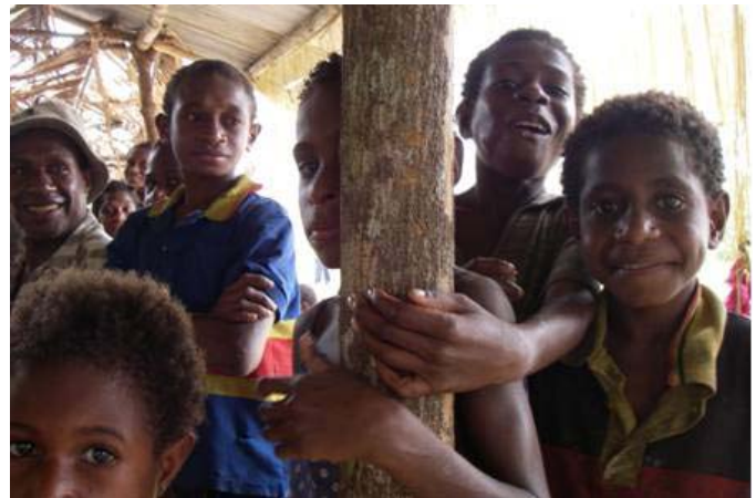
Children observing.