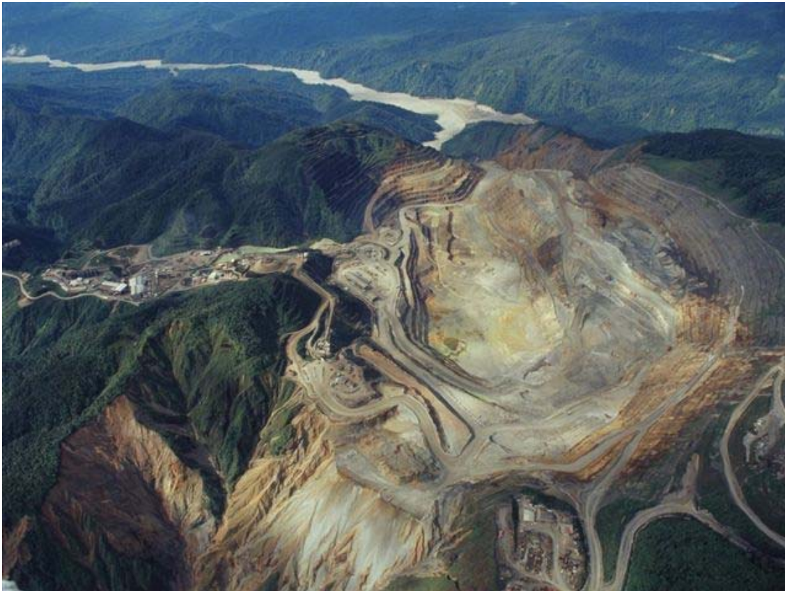
Mt. Fubilan Pit, Ok Tedi Mine.