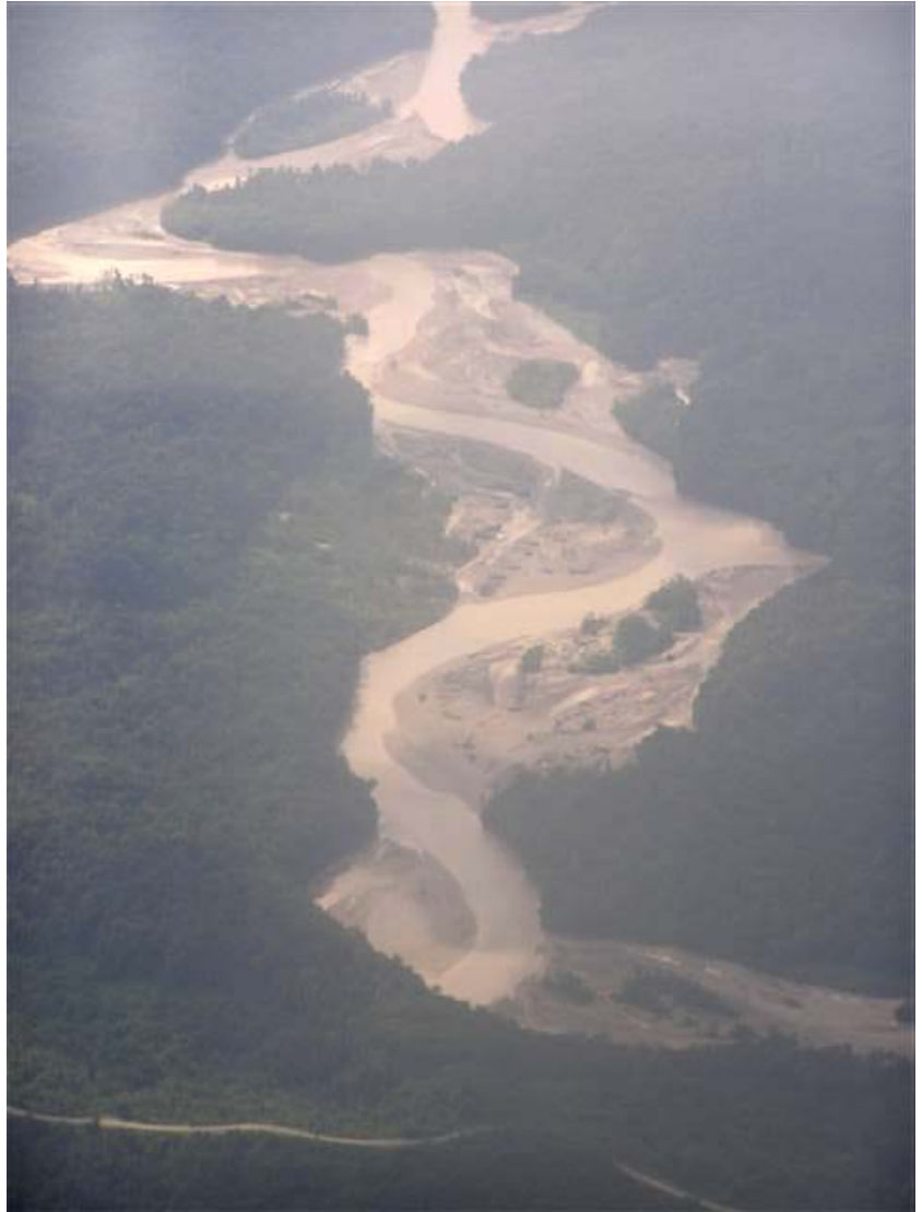
Ok Tedi River.

The river is also the depository of millions of tons of rock waste and tailings. That trade-off—the benefits and costs of large-scale environmental degradation weighed against large-scale economic gain—is at the heart of these negotiations.