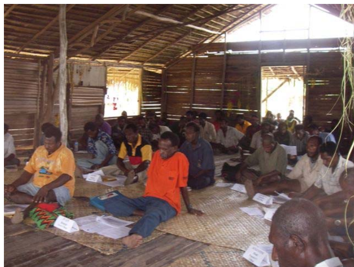
Village meeting.

In order to address these two fundamental criticisms, Keystone recommended a facilitated negotiation model that would try to maximize opportunities for collaborative problem solving, transparency, and the highest possible levels of “informed consent” achievable in a country with isolated populations, extremely poor communication and transportation infrastructures, limited civil society, and high rates