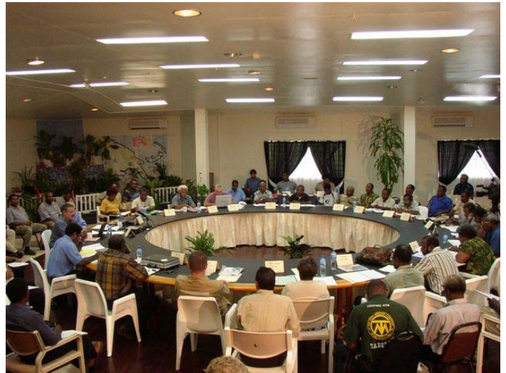
Working Group meeting.

At the start of the Working Group process, the remaining value of funds available from the original CMCA agreement (from 2007 to expected mine closure in mid-2013) was roughly K78.8 million. At the second Working Group meeting, OTML offered K118.2 million as a guaranteed floor plus more if copper and gold sales proved better than 2.5% of cash flow. At the third Working Group meeting, community delegates put forward an unquantified interest-based proposal for new health, education, and job training services, new infrastructure, and unspecified new amounts of cash. Unofficial estimates put the value of the package proposed by the community delegates at between one and three billion kina. At the fourth meeting, OTML, in combination with PNGSDP and national government's Minister of Mining, came forward with a combined proposal of K820.9 million. After further discussions between meetings and at Working Group 5, the parties agreed, in principle and subject to ratification at the regional and village levels, to a package valued at K1.1 billion.