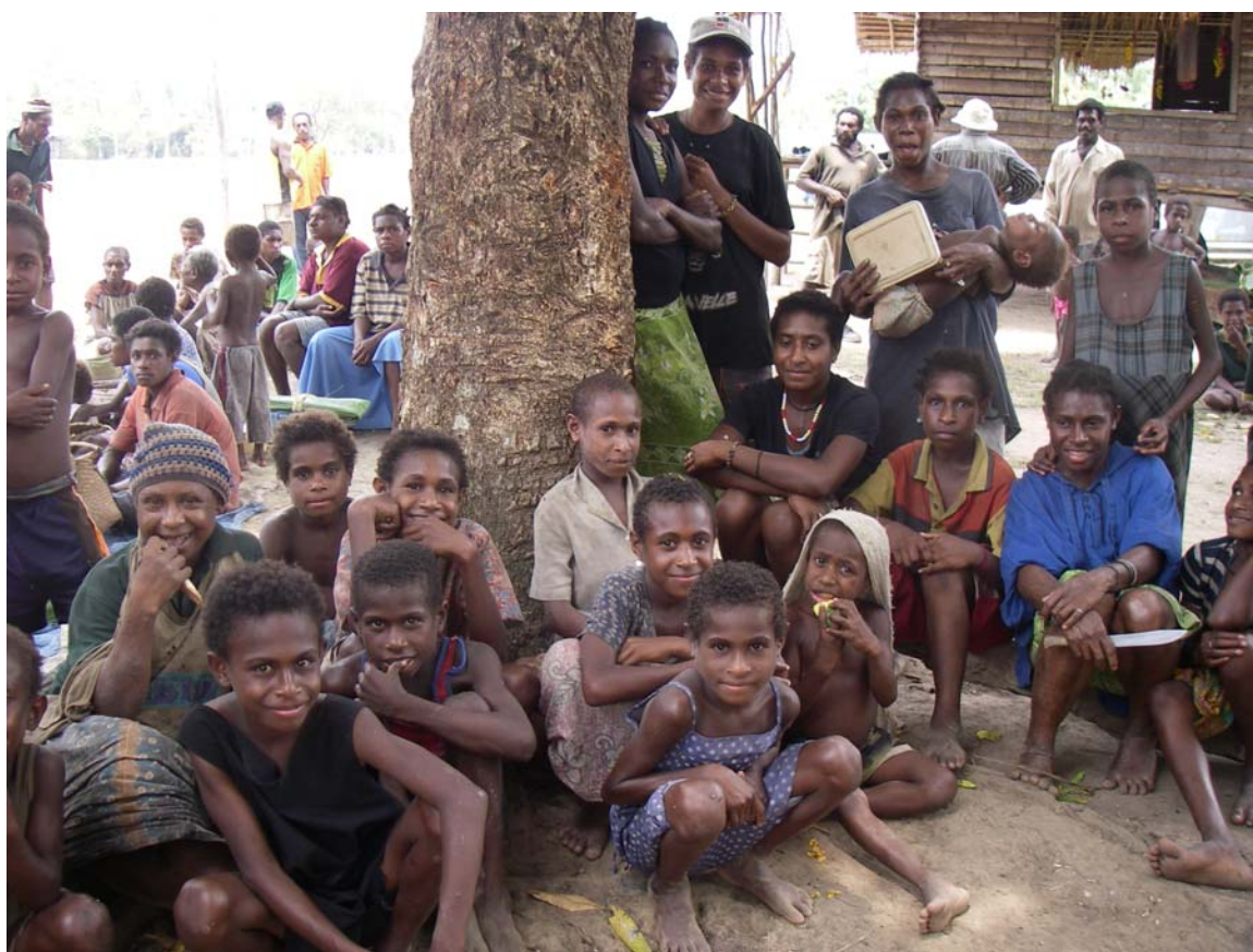
Villagers gathering for a meeting.

We end our work in PNG with great pride and a renewed belief in the power of well-crafted multi-party negotiation processes. Given the right conditions, individuals with different ideas and beliefs can, and do, bring forth a collective and durable wisdom. The many people who participated in these negotiations from PNG’s villages, from the mine, from the NGOs, and from the government will be in our hearts forever.