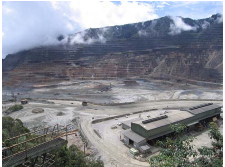
Ok Tedi Mine.

In 1984, the foundations of the proposed tailings dam were lost to a massive landslide. It was further determined by the mine and the government that there was no other effective technical means for containing and stockpiling tailings. Realizing that the only feasible way of allowing the mine to proceed was by allowing it to put its rock waste directly into the river, the PNG National Parliament passed legislation known as the Mining (Ok Tedi Third Supplemental Agreement) Act 1983, which amended the Principle Agreement of 1976. For the next decade, BHP discharged 80 to 90 million tons of rock waste per year into the Ok Tedi River as copper and gold production increased.