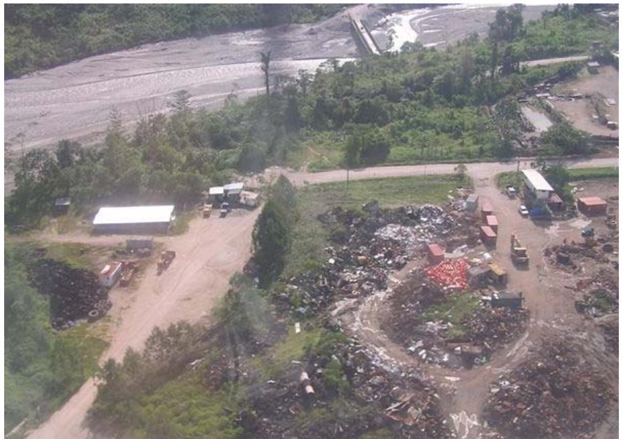
Aerial image of Tabubil.

Whether “informed consent” was actually achieved has been a matter of debate, but 14 different and unequal individual trust agreements were separately negotiated based on then current and projected damages. Just as important, a number of individuals and villages who had supported the lawsuit chose not to participate in the settlement. Included in the CMCA arrangement was a provision to review the operations of the agreement after five years, and/or if the environmental predictions for environmental impact outlined in the CMCAs were exceeded.