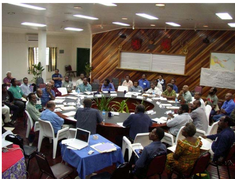
Working Group meeting.

Many regional leaders were initially hesitant about selecting only three Working Group delegates. They feared being marginalized in the negotiation process, not having their specific interests or language groups represented, or seeing old tribal, clan, inter-village, or inter-regional enmities disadvantage them in some way. Many villages proposed their own specific place at the Working Group table. After discussion, most villages readily understood the problem of trying to manage 157 delegations at any one meeting. They accepted the idea of more indirect representation and agreed that it would be the job of the Working Group delegates to act on behalf of all the people of the region while reserving any final decision-making regarding revised compensation agreements.