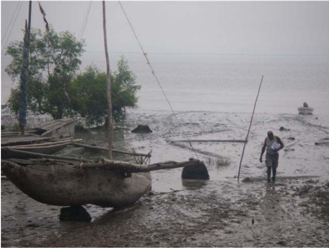
Arriving at a village meeting.