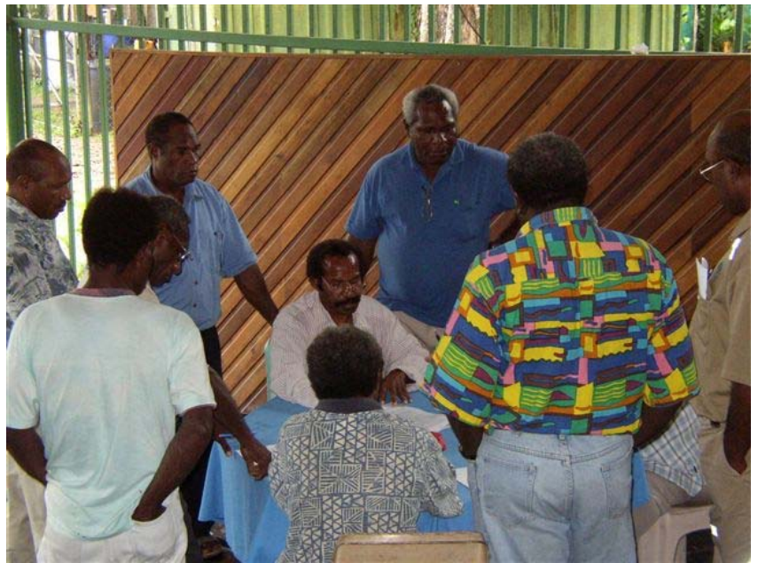
Delegates meeting.

The negotiation was designed to track over three broad phases. The first would be a full and open exchange of economic and scientific information and the creation of criteria for making ultimate decisions about compensation. The second would be the development of one or more proposed packages containing different compensation options. The third would be actual decision-making around a preferred and mutually acceptable option. It was also agreed that before and after each of the six scheduled Working Group meetings, regional and village level meetings would be held to ensure the fullest understanding of issues and options and to garner feedback on any emerging package.